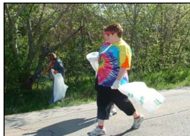
ROXY ON THE PROWL