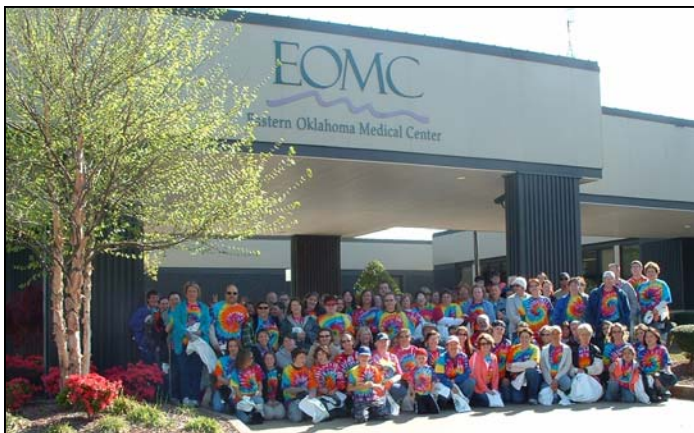
EOMC TRASH OFF CREW READY AND WILLING