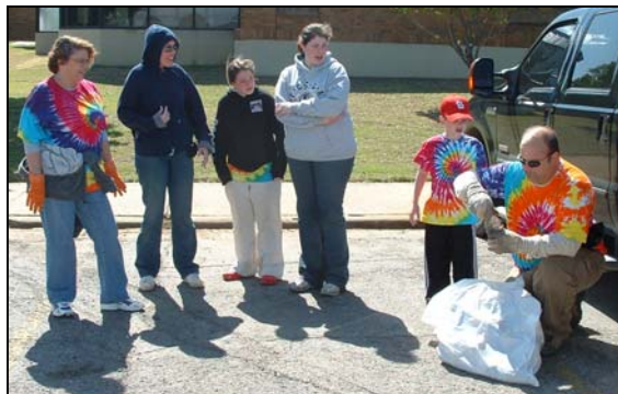
CEO FINDS TREASURE